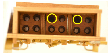
(d) Seller verifiability (i.e. view from bottom).