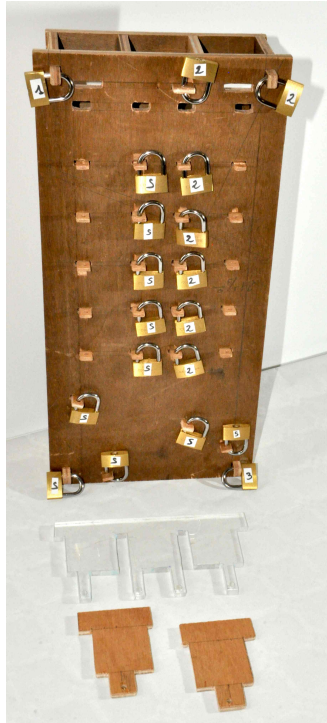
(a) The Woodako box after the bid of bidder number two.