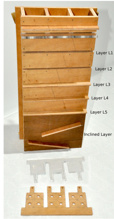
(c) The Woodako box after two prices have been tested.